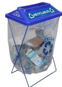
Event recycling or Classroom recycling