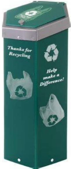
Plastic Bag Recycling bin