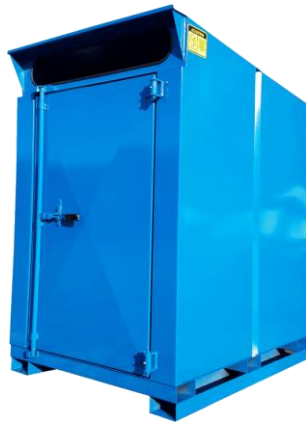
Mini-Cycler- limited locations only