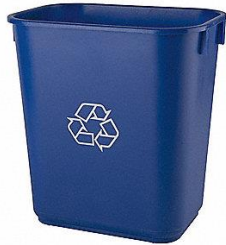
Desk-side recycling bin