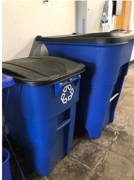
50 gallon and 95 gallon Recycling Totes