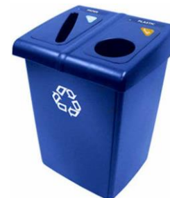
Recycling Station (limited availability)