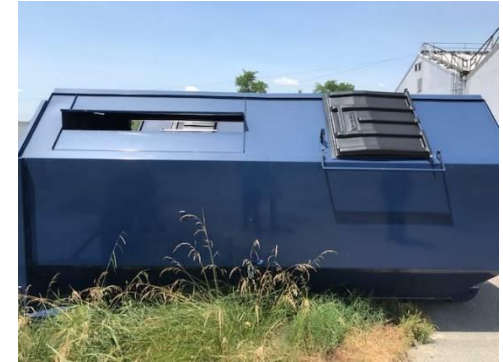
Large 21 yard Outside bins (Prior approval required)