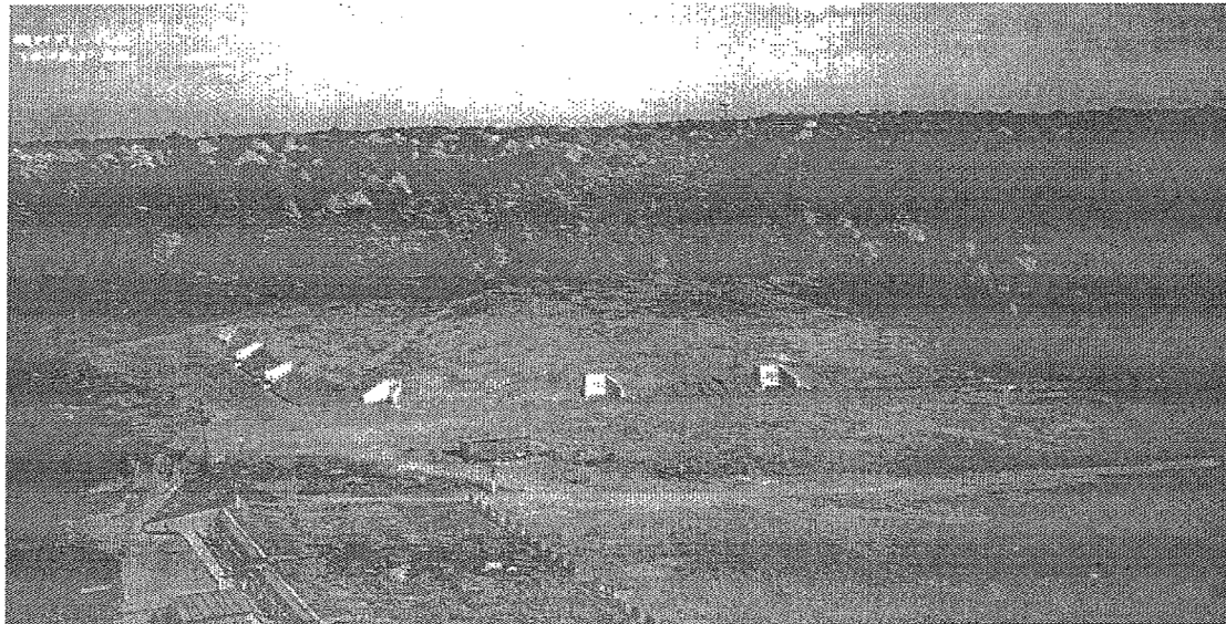
Photograph of the ammunition pits and rifle range at Marine Barracks Quantico, Va., dated 21 October 1932.